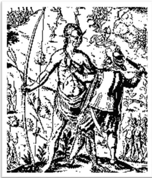
Figure 1: "C. Smith Taketh the King of Pamaunkee Prisoner, 1608." Engraved by Robert Vaughan for John Smith's General Historie , (London, 1624).

Beverley’s depiction of Opechancanough as a tall, athletic man fits with Gabriel Archer's representation of Powhatan males as “proper, lusty, straight men, very strong.” And a contemporary illustration of John Smith taking Opechancanough prisoner shows a somewhat undersized Englishman scuffling with a well-built Native American at least a head taller than himself. 35